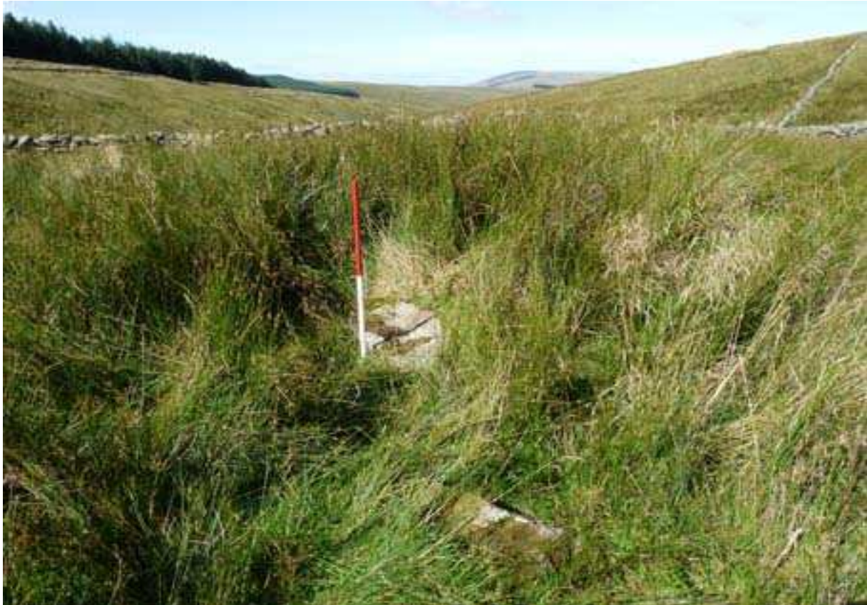
Plate 2: Showing raised platform, 20m upstream from sheepfold.