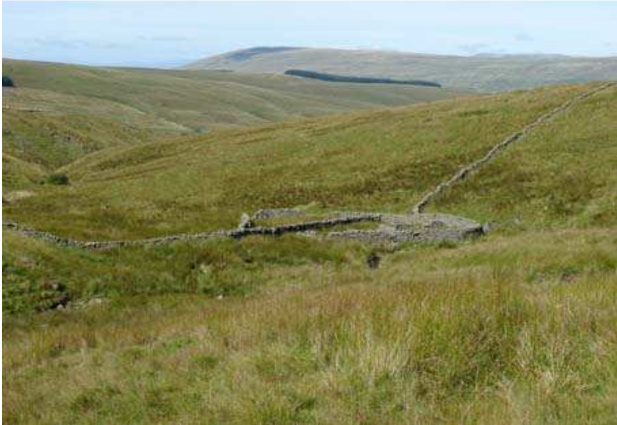
Plate 1: Showing sheepfold in Helmit Rake.