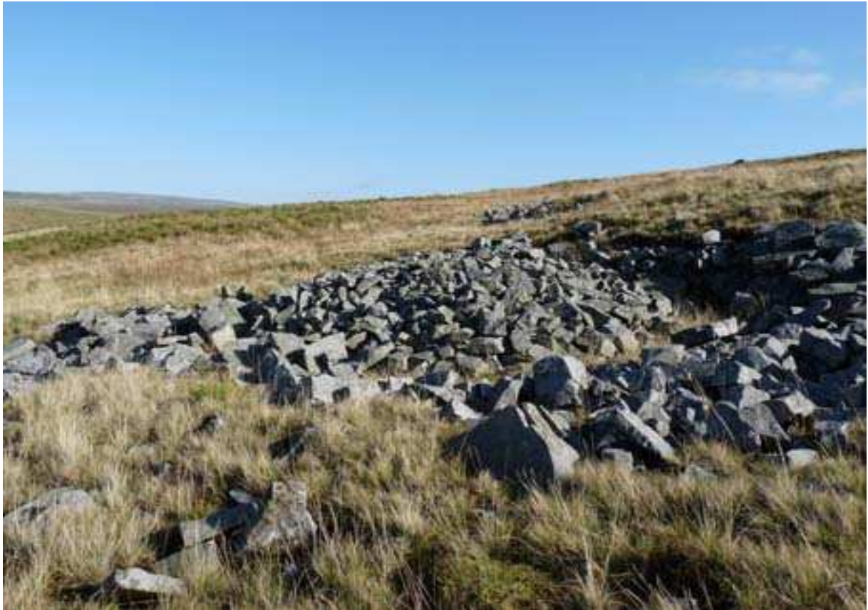
Plate 3: The boundary marker in the hurle of stones.